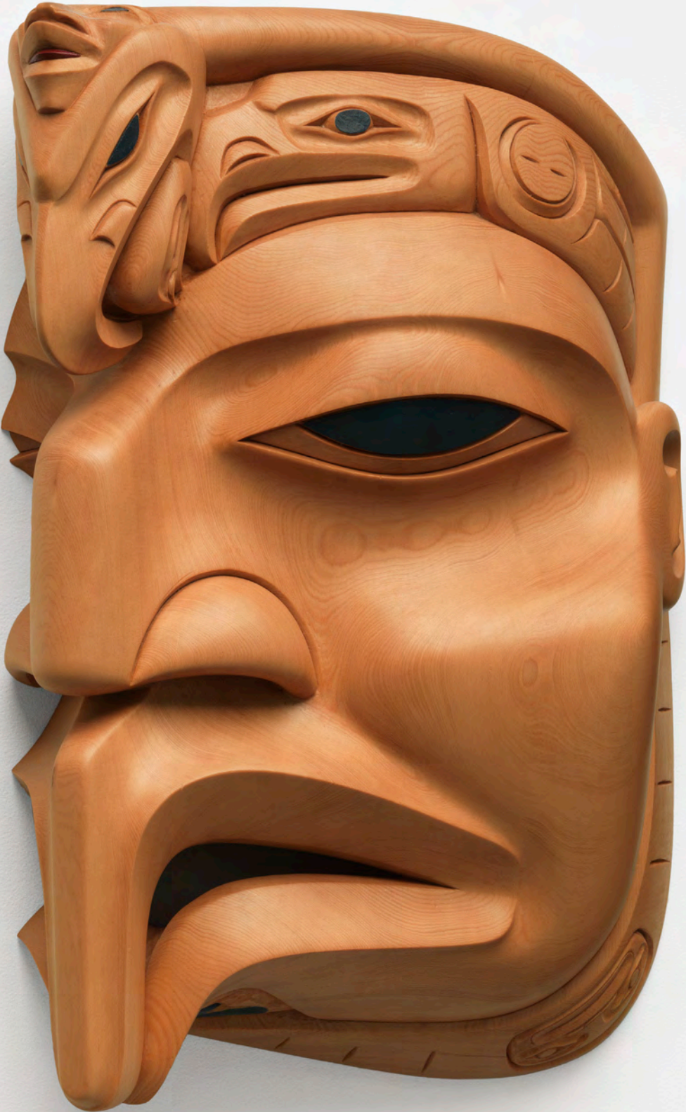
Image: Dempsey Bob (1948 - ) Northern Eagles Transformation Mask , 2011 Yellow cedar and acrylic pigment 40.6 x 58.4 cm Promised Gift. Audain Collection TAAM.2015.021

George Paulding Farnham (1859 – 1927) Ptarmigan Vase , c. 1900 – 1903 Copper, silver and gold 63.5 cm high Purchased in 2011 with the assistance of a grant from the Government of Canada under the term of the Cultural Property Export and Import Act National Gallery of Canada (no. 43265)